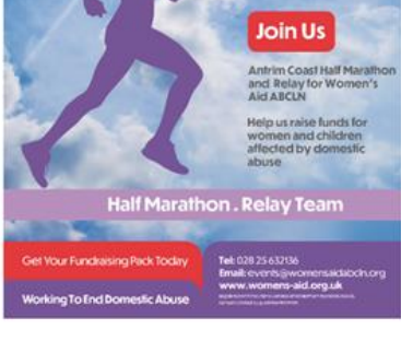
Half Marathon & Relay Sunday 25th August