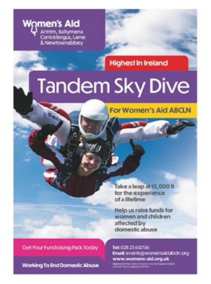
Join Us Book Your Jump Date Today